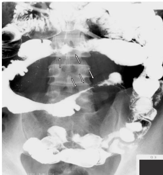
Fig. 1. A barium small bowel study before infliximab treatment demonstrates severe stenosis of the ileum (arrows).

The patient's post-transplant course was uneventful regarding his heart. Before the transplant and five years afterwards, he presented no symptoms related to CD and he had received no treatment for it. In 2002, he underwent an operation for an anal fistula and a peri-anal abscess as a result of CD. At that time, he presented with symptoms consistent with intermittent small bowel obstruction related to CD and he was therefore hospitalized to receive conservative therapy. In January 2003, a barium bowel series and enteroscopy demonstrated severe stenosis (Fig. 1), in addition to longitudinal deep ulcerations in the distal small intestine. Beginning in February 2003, he received infliximab (5 mg/kg of body weight) intravenously three times at weeks 0, 2, and 6 (Fig. 2). In the middle of March, his bowel symptoms had improved significantly and he could eat normally. A follow-up barium small bowel series and enteroscopy demonstrated an improvement in findings. The severe stenosis and longitudinal deep ulcerations had, respectively, become mild and superficial. During the infliximab treatment, he continued to receive the immunosuppressive regimen for the heart transplant. He was discharged