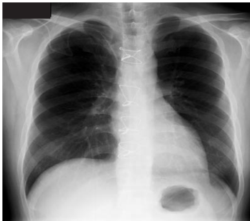
Fig. 3. Chest X-ray on emergent arrival is uneventful regarding his heart.

There are two contradictions in this case. Based on the theory that an inflammatory bowel disease (IBD) such as CD is an autoimmune disease, a flare-up of CD in a patient under immunosuppressive therapy is the first contradiction. There is controversy over