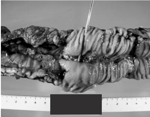
Fig. 4. The perforation is located at the bottom of the ulcer. The probe is inserted into the perforated part.

the degree of IBD activity after transplant. There have been reports of no difference in IBD activity and improvement in IBD symptoms 4, 5) . Riley et al. 2) reported 14 patients (0.2%) who developed IBD after a transplant despite immunosuppression, and the average time to IBD diagnosis was four years. In this case, a flare-up of CD occurred five years after the transplant. Cyclosporine, one of the immunosuppressive agents, might therefore not be an effective agent for remission in CD 5) .