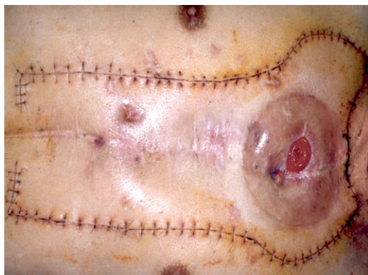
Fig. 7. Long skin role: delayed flap and design