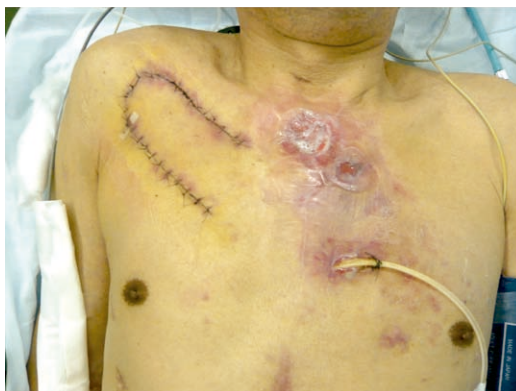
Fig. 1. Delayed deltopectoral skin flap

Seven to 10 days prior to the operation, create a surgically delayed flap and suture it back to the skin (Fig. 1). This can prevent a decrease in blood flow during the operation. The DP flap gets its blood supply from both perforating branches of the internal thoracic and thoracoacromial vessels. Since the perforating branches in the second intercostal are normally thought to be the most developed, to