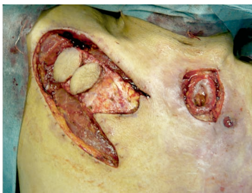
Fig. 2. Skin flap and fistula

We recommend to evaluate the blood flow by checking the color of the skin flap and the amount of bleeding and suture the defect in two layers with 4-0 absorbable monofilament sutures (Figs. 2, 3a, and 3b). The final 2-3 stitches should be in a Gambee suture pattern (Fig. 3c). If there is no tension in the skin defect in the donor site, it can be closed by primary suture (Figs. 4, 5 and 6). If there