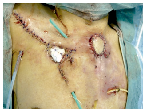
Fig. 6. Completed appearance

A patient, eighty years old male had reconstruction with the ascending colon after an esophagectomy because of a gastrectomy. A reconstruction with