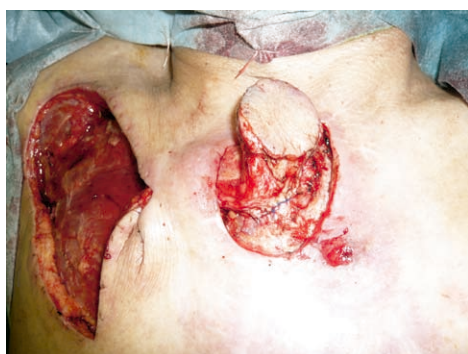
Fig. 4. Completed closure of the fistula