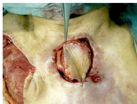
Fig. 5. Closure of the skin defect with an island skin flap

is tension, it is possible to use a skin mesh from the femoral area to close the opening.