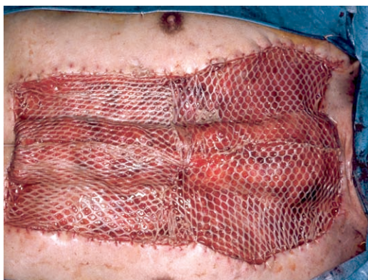
Fig. 9. Long skin role covered with mesh skin grafts

Numerous improvements and advances in operational methods and techniques have occurred in the area of reconstruction for esophageal cancer 4) . Generally, the types of skin flaps and musculocutaneous flaps used for cervical esophagus reconstruction are DP flaps, pectoralis major