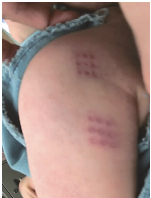
Fig. 3. The appearance of the BCG site 8 days after hospital discharge is shown.

Following BCG vaccination, redness and swelling at the vaccination site are generally observed around the 10th day, with a peak within 4 – 6