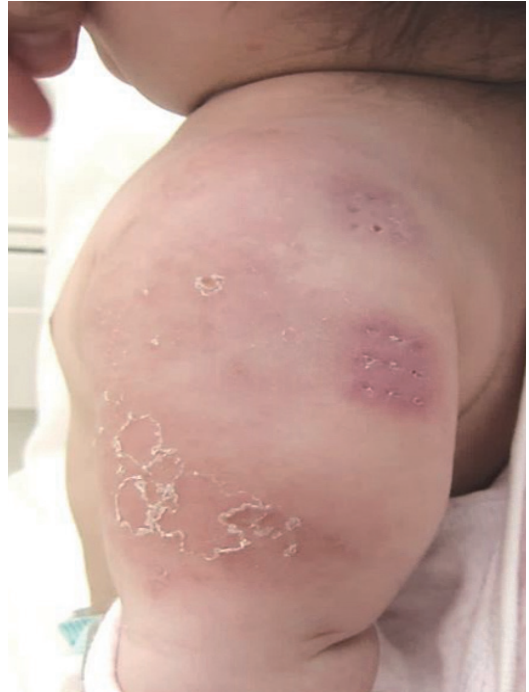
Fig. 2. Rapid improvement of inflammatory findings on the left upper arm on the 5th hospital day is shown.

Fever was not observed thereafter, and the axillary lymph node swelling and inflammatory findings on the left upper arm improved rapidly (Fig. 2). As S. pyogenes was detected from a culture of the pus from the scars at the BCG vaccination site, it was assumed to be the causative agent. Laboratory findings improved to: white blood cell count, 9,660/ \mu\text{L} ; and C-reactive protein level: 0.12 mg/dL on the 5th hospital day. Antimicrobial drug treatment was changed to oral administration of amoxicillin at 16 mg/kg 3 times/day for 5 consecutive days, and the patient was discharged from the hospital on the same day. The appearance of BCG site in convalescent phase (8 days after hospital discharge) is shown in Fig. 3.